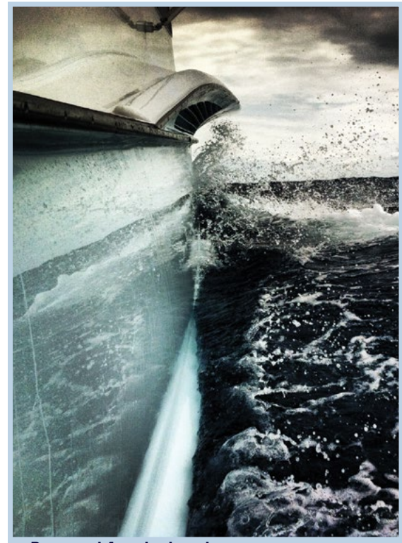
Designed for the harsh marine environment

move value in every can. For example, one gallon of ALEXSEAL Topcoat mixes to provide more sprayable material than any other manufacturer. Compare that to any competitive product and the superior value will become clearly obvious.